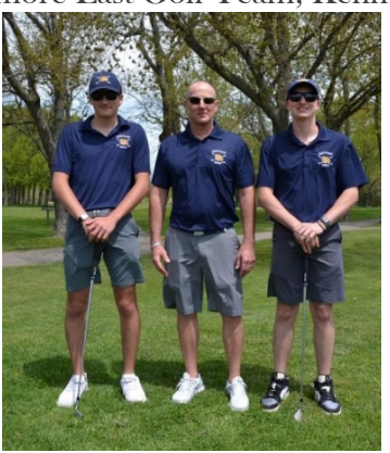
Kenmore East Golf Team