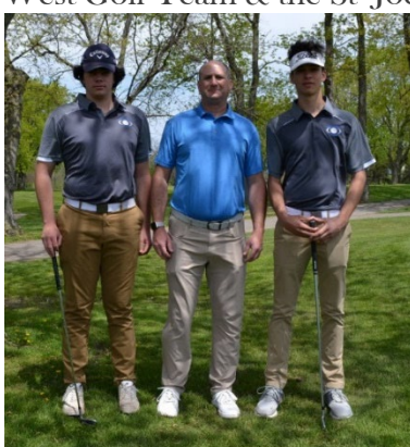
Kenmore West Golf Team