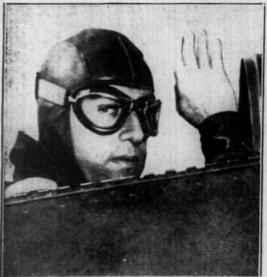
MOLLISON READY FOR SEA HOP —Capt. James Mollison, British trans-ocean flyer, waves from the cockpit of his big monoplane after a test hop from Floyd Bennett field. Mollison hopes to take off on his projected New York-to-London flight today, weather permitting.