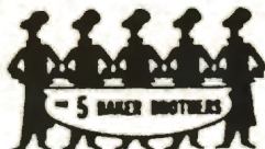
The 5 Baker Brothers

2971 DELAWARE AVENUE KENMORE, NEW YORK 14217 874-2253