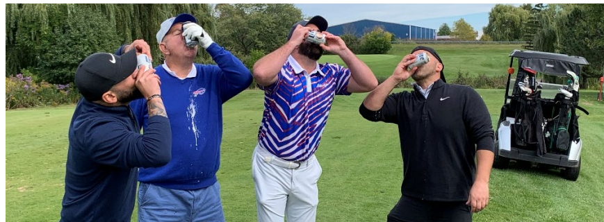
Random Guys Who May or May Not Be Part Of The Club ????